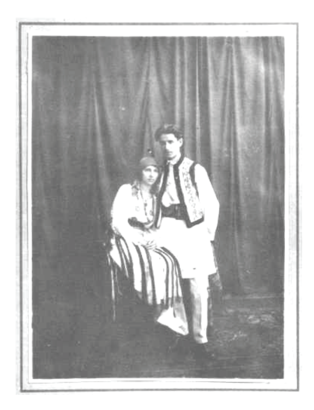
Wedding photograph of Corneliu Zelea Codreanu and Elena Ilinoiu, at Crâng, near Focşani, 13 June 1925. The ceremony was filmed, but the police destroyed all copies, on the gournd that the movie was a sensitive propaganda material.

The process of nationalizing the state in Greater Romania thus generated as a side effect the confrontation between the hegemonic official culture and the radicalized student counterculture. The main promoter of this counterculture was the nucleus of the Văcăreșteni, which had been formed by plans of criminal plots, the common experience of prison, and assassinations. Its main founders, Corneliu Zelea Codreanu and Ion I. Moța, spelled out students' frustrations and put forward a mystical sublimation of their experience.