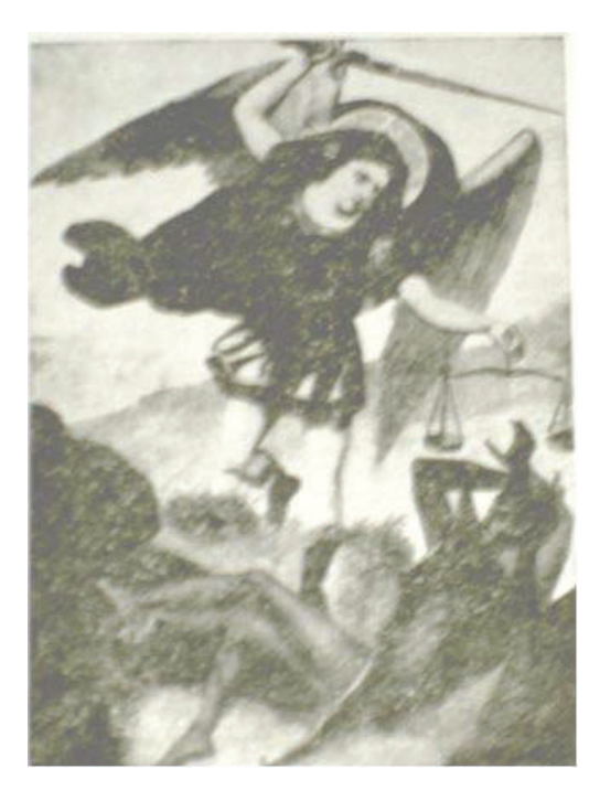
The icon of Saint Michael from the Văcărești monastery, which allegedly inspired Codreanu's charismatic "revelation." Saint Michael is depicted holding the sword in one hand and the scale of justice in the other.

The cult of the punitive figure of Saint Michael thus became the main source of the Legion's doctrine and the object of a fanatic Legionary cult: Michael's observance on 8 November was proclaimed the official celebration of the movement. Legionaries adopted an apocalyptic, Manichaean vision of the world, portraying themselves as an earthly Christian army, as knights of the light in perpetual fight with the devil, a feature that accounts for the inherent violent and revengeful character of the movement. A quotation from the Bible eloquently speaks for the militant character of Saint Michael: