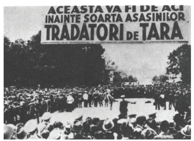
The summary execution of the Legionary death squad, in the same square where they assassinated Prime Minister Armand Călinescu.

The picture occasions a comment on the nature of political violence in the Balkans. In view of irredenta wars and forced population movements that accompanied the formation of nation-states, the area has been generally regarded as a classic locus of violence. Most recently, numerous scholars have reacted against the "essentialization" of the historical experience of the Balkans, pointing out that violence is a universal practice, no region possessing a monopoly on it. In his short history of the Balkans, Mark Mazower argues that the association of the Balkans with violence is in fact due to a change in the concept and meaning of "acceptable violence" in the West. 409 If in the Middle Ages executions used to take place in the public square, beginning with the second half of the nineteenth century,