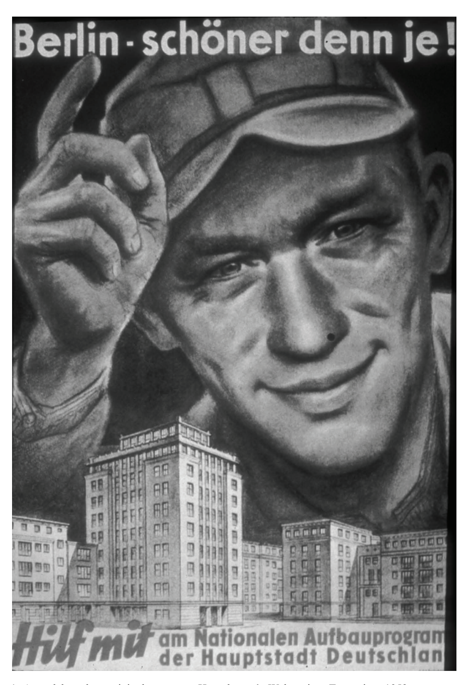
Figure 1. A model worker-activist looms over Henselmann's Weberwiese Tower in a 1952 poster promoting the 'National Building Program for Germany's Capital', and its goal of making Berlin 'more beautiful than ever'.

movements, framed the architect's Socialist Realist conversion with standardized