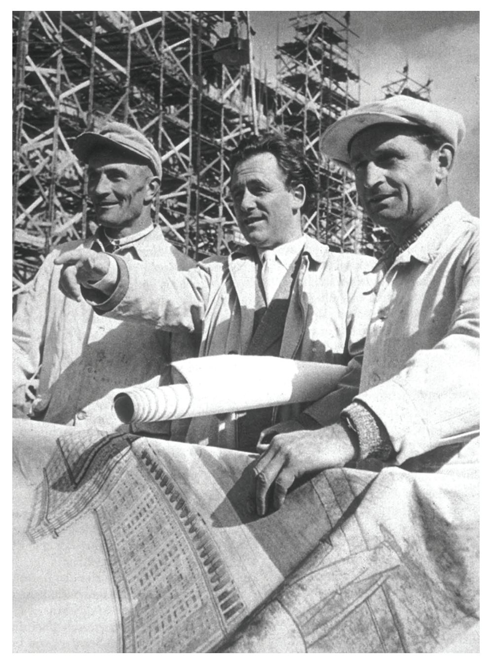
Figure 2. Hermann Henselmann, centre, flanked by two construction workers in an East German publicity photo, c. 1952.